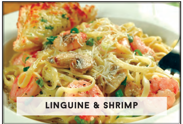
LINGUINE & SHRIMP

The King Salmon is one of Pete's favorite sea food dishes. Pan fried salmon over a bed of spaghetti tossed with asparagus and sautéed onion in a lemon cream sauce topped with parmesan cheese and parsley. Sure to satisfy all your sea food desires. Served with soup or salad. $22.99