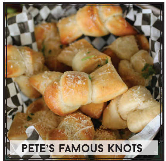
PETE'S FAMOUS KNOTS