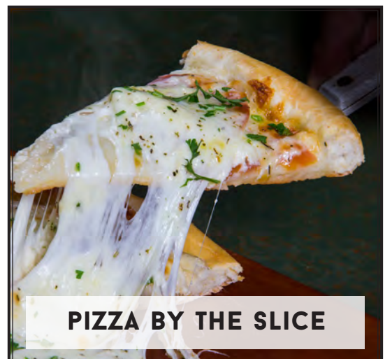
PIZZA BY THE SLICE