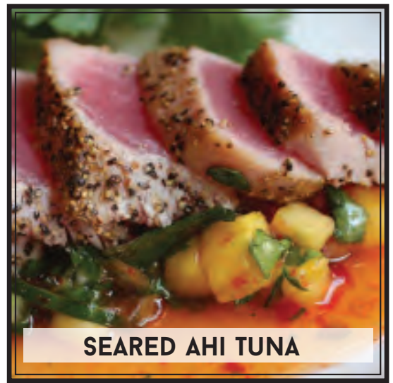
SEARED AHI TUNA